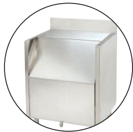
Optional Locking Cover Available - Includes Padlock & 2 Keys