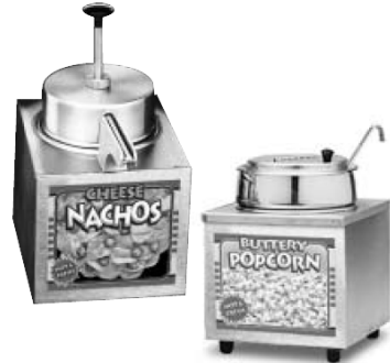
Model: Nacho Cheese Pump and Hot Butter Warmer