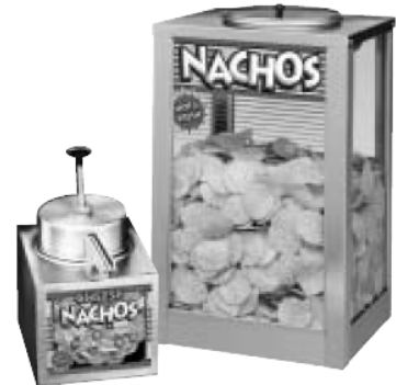
Nacho Cheese Pump with Nacho Cabinet