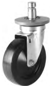
swivel caster with resilient tread

Eagle Stem Caster, model _____. For use with 1"-diameter posts. Resilient or polyurethane tread. Casters with zinc, stainless steel, and polymer boot available. For electronic handling, conductive casters and vibration dampening casters available. Donut bumper included with all stem casters. Swivel casters have a temperature rating of -15°F (-26°C). Note: These stem casters cannot be used with Master Trak® Shelving.