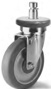
(nickel-plated) caster with polyurethane tread