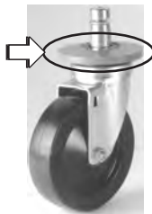
donut bumper (circled)