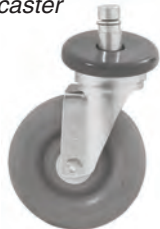
vibration dampening caster