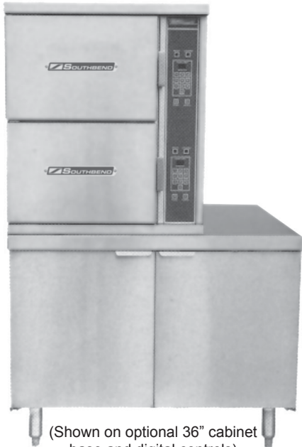
(Shown on optional 36" cabinet base and digital controls)