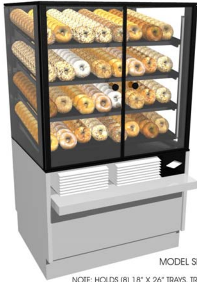
MODEL SHOWN: CSF4231

Lengths include end panels 42"L x 36-1/2"D x 65-1/4"H