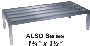
ALSQ Series 1 3/4" x 1 1/2" Tubular Frame