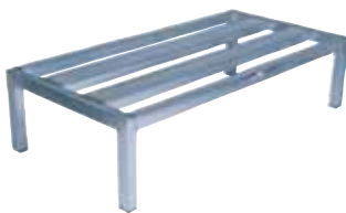
ALCH Series Tubular frame with 4" E-Channels.

Against Rust or Corrosion on All Aluminum Products.