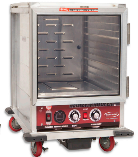
NHPL-1810HHC Fits under counters and tables.

For replacement parts please see page 143.